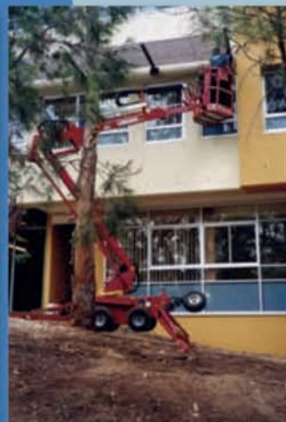
Sloping ground can be worked safely thanks to the long travel of the hydraulic stabilizer legs.