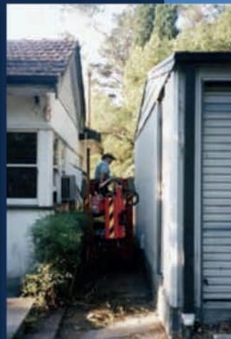
Backyard access is easy thanks to the compact dimensions of the Leguan.