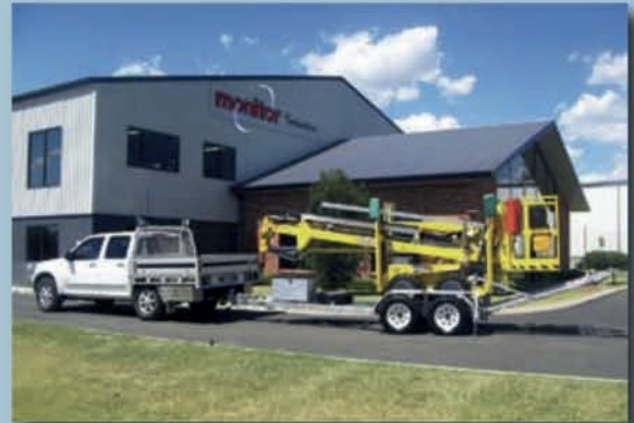
Set up on a strong steel trailer, the combined weight of the Leguan and trailer is under 2 tonnes, allowing it to be easily towed behind most tradesman's vehicles.