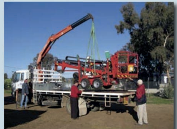
Lifting points are standard on all Monitor spider-lifts. Being light in weight they are very easily lifted onto trucks or difficult job sites.