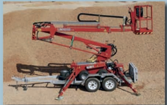
The Leguan can be set up and elevated whilst still on the trailer, or can be driven off and used separately.