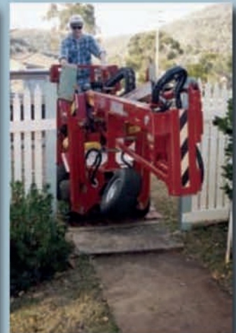
Operator visibility is excellent, allowing for precise manoeuvring through difficult areas.