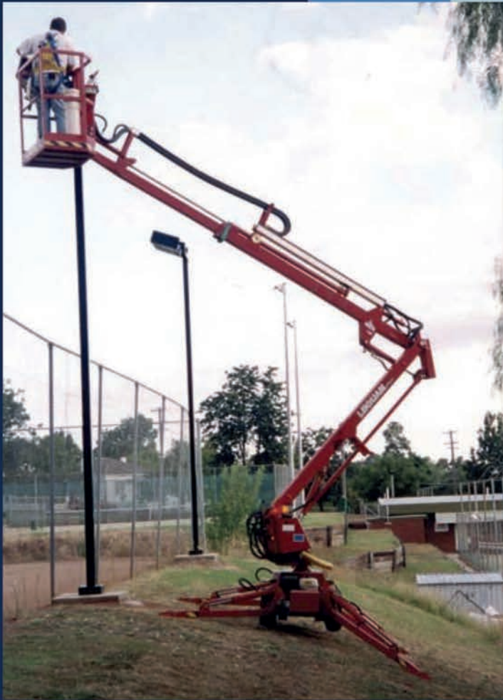
Compact in size and with 4 Wheel Drive, the Leguan can access many difficult locations. Being skid-steer, the Leguan turns on the spot, and with all controls conveniently located in the platform, is very quick and easy to operate.