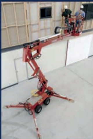
The 125-200 is certified for two operators, and the load control system prevents operators overloading the machine.